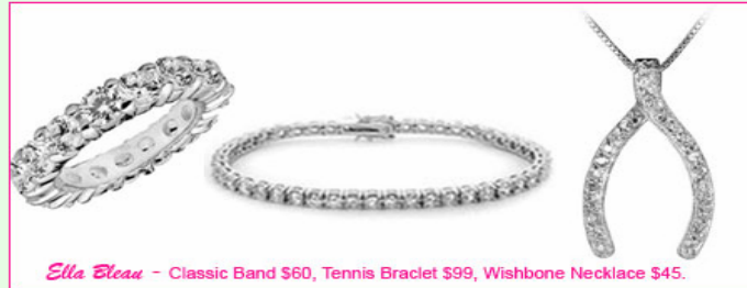
Ella Bleau - Classic Band $60, Tennis Bracelet $99, Wishbone Necklace $45.

Melbourne online fashion jeweller, Ella Bleau Jewellery said they always see an increase in orders around October but become inundated with orders the week before Melbourne Cup.